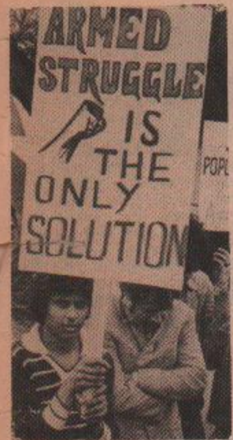
to armed struggle

Last year, American imperialist leaders made it