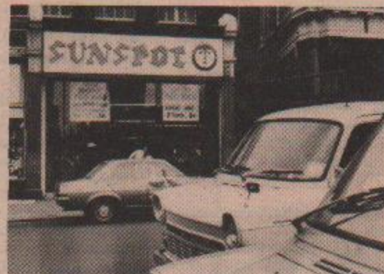
The Sunspot club: an influx of unemployed youth

crowded with unemployed youth, that the bingo hall has been cut in half and pool tables have been brought in instead.