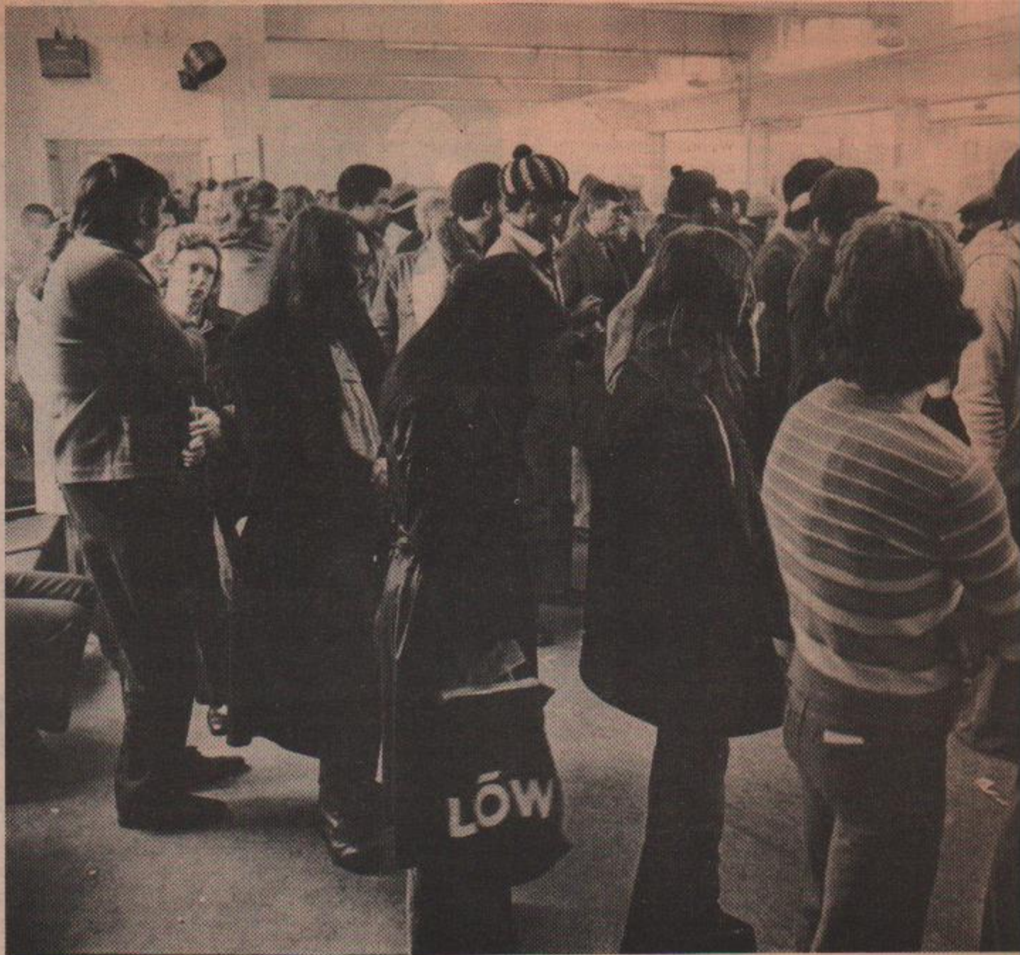
The Battersea dole queue