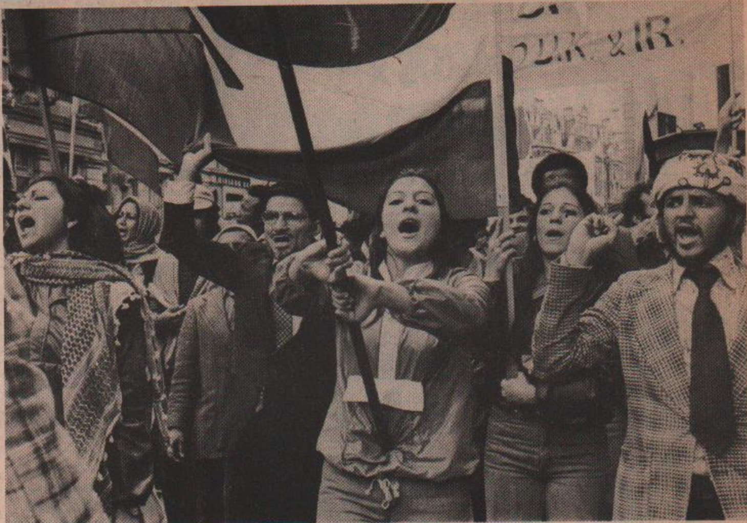
SLOGANS on the demonstration were: 'Free Palestine! Down with Zionism!' Young Socialists shouts of 'Long live the Arab revolution! Forward to the world revolution! Victory to the PLO!' were taken up by many marchers.

OVER 2,000 Arab workers and students marched through London last Sunday demanding a free, democratic, secular state of Palestine.