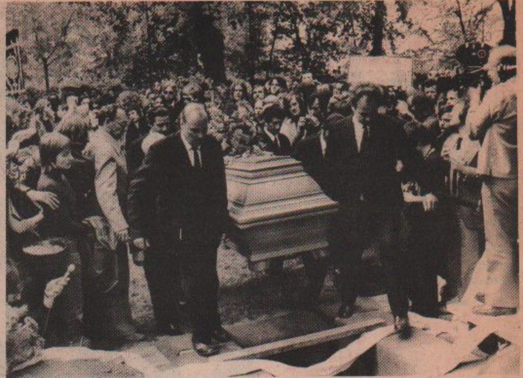
Emotional scenes at Ulrike Meinhof's funeral