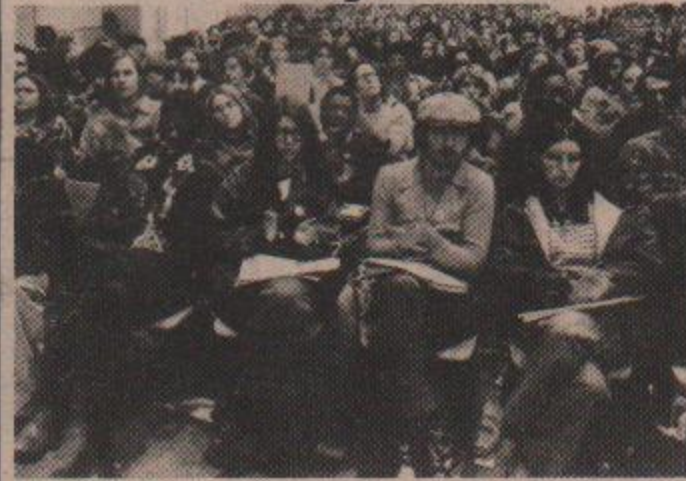
THE Founding Conference of Revolutionary Youth last November: since then the International Youth Committee has made important strides forward.

THE International Youth Committee of the Fourth International will hold three Regional World Delegate Conferences in November - December this year.