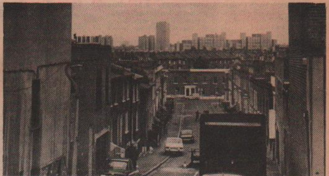
Housing conditions in Battersea

The 'Sunspot' amusement arcade in St John's Hill, Battersea, is so