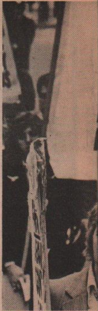
YS position on unemployment is c

3. Build the revolutionary party to prepare to take the working class to power and put end to this crisis-ridden system. Only then will young people control their own lives instead of having them determined by the profit calculations of the exploiters.